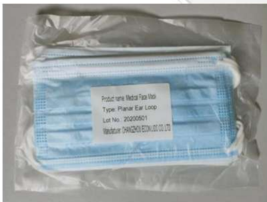
Photo of Samples